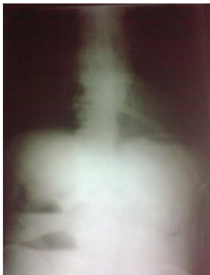
[Table/Fig-2]: X-ray erect abdomen showing no free gas under diaphragm